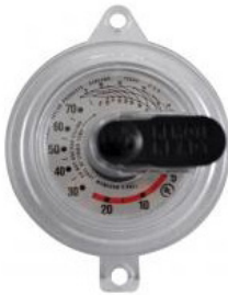
R3D LP Dial Sr. Tab

The GEN 3 Propane Level Monitor supports both Jr. and Sr. R3D Gauges. IOT's level monitor does not support anything outside of this specification.