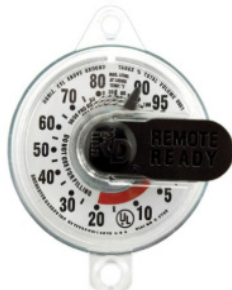
R3D LP Dial Jr. Tab